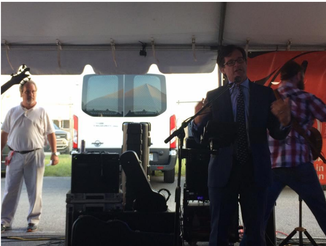
IMS President speaking during the Runoffs welcome party.