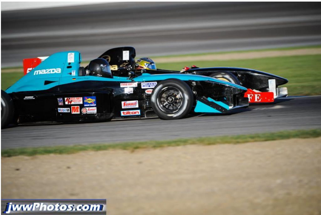
Clemens at Runoffs